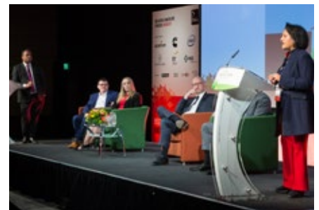
Krishnan Guru-Murthy hosted our Knowledge Forum, bringing together Accenture, EY and Merck.

OF OUR EMBs SAY THEIR EXPERIENCE WITH MSDUK MET OR EXCEEDED EXPECTATIONS