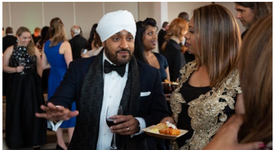
MSDUK's International Annual Conference and Awards events are always glamorous and engaging.